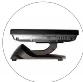
Flat Folded Mode