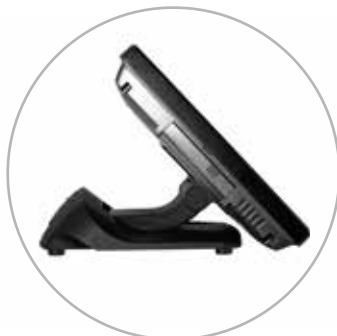
Low Profile Mode