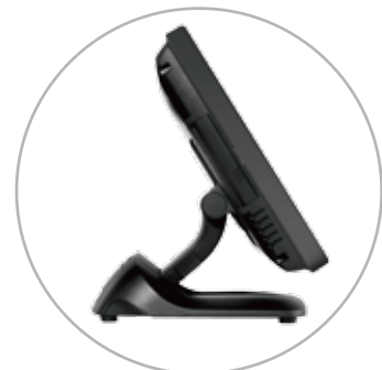
Full Extended Mode

The XT-5415IR provides the selection of two foldable bases, the curvy slim GEN7E base and the larger but practical GEN8E base. The foldable base can be configured into "Flat Folded Mode" to save the shipping package volume, "Low Profile Mode" to allow greater interaction between the cashier and the customer, and the traditional "Full Extended Mode". All this can be achieved with a simple pull of the hidden lever.